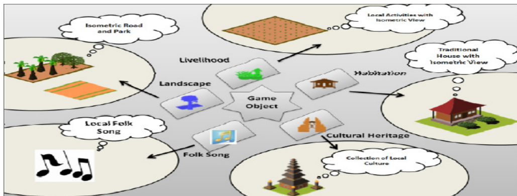
Fig. 3. Object Rich Picture