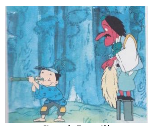
Figure 3: Tengu (3) (Kawauchi, 2007:184)

The third folklore about tengu is "Tengu no Kakuremino" ( Tengu 's Magic Cloak). In this story it is told that the tengu character has a magical object in the form of a cloak. The tengu is curious about an object made of bamboo that resembles a telescope brought by a child. The curious tengu exchanges his most valuable object for a telescope that the child carries. Firstly, the child does not want to exchange, but finally he gives the telescope to the tengu . Actually the telescope that is thought to be a magical object by the tengu is just an ordinary bamboo stick; the child just wants to make fun on the tengu . The story ends with the child who uses the tengu 's cloak for mischief only. The tengu still believes that he can see strange things from that bamboo stick.