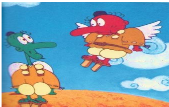
Figure 2: Blue Tengu and Red Tengu (Kawauchi, 2007:34)

Seeing how happy the blue tengu is, the red tengu wants the same thing. The red tengu extends his nose, but this time his nose is meeting the palace soldiers who are practicing martial arts so that his nose is injured. The red tengu immediately pulls his nose back while he is in pain. The blue tengu who knows this then comforts the red tengu and gives him one of those beautiful komono clothes.