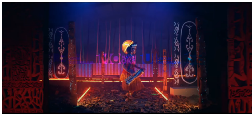
Figure 1. Visual analysis Aluyen dance from Papua

The theme of the advertisement is 76 th Dirgahayu Indonesia , this corresponds to the brand of the cigarette being promoted. The theme of Djarum 76 advertisement is Indonesian culture, it is celebrated Dirgahayu Indonesia because in 2021 marks the 76 th years of Indonesian Independence.