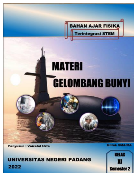
Figure 1. Cover Design of Sound Wave Teaching Materials

Based on the problems from the preliminary study stage, the next stage of development or manufacture. At this stage, STEM-integrated ICT-based teaching materials are designed to improve students' data and technology literacy. Teaching materials are used as learning resources and make it easier for teachers to deliver learning materials and students become easier to understand the material being studied. ICT-based teaching materials were developed using Flip PDF Corporate Edition software. The cover design of the developed ICT-based teaching materials can be seen in Figure 1.