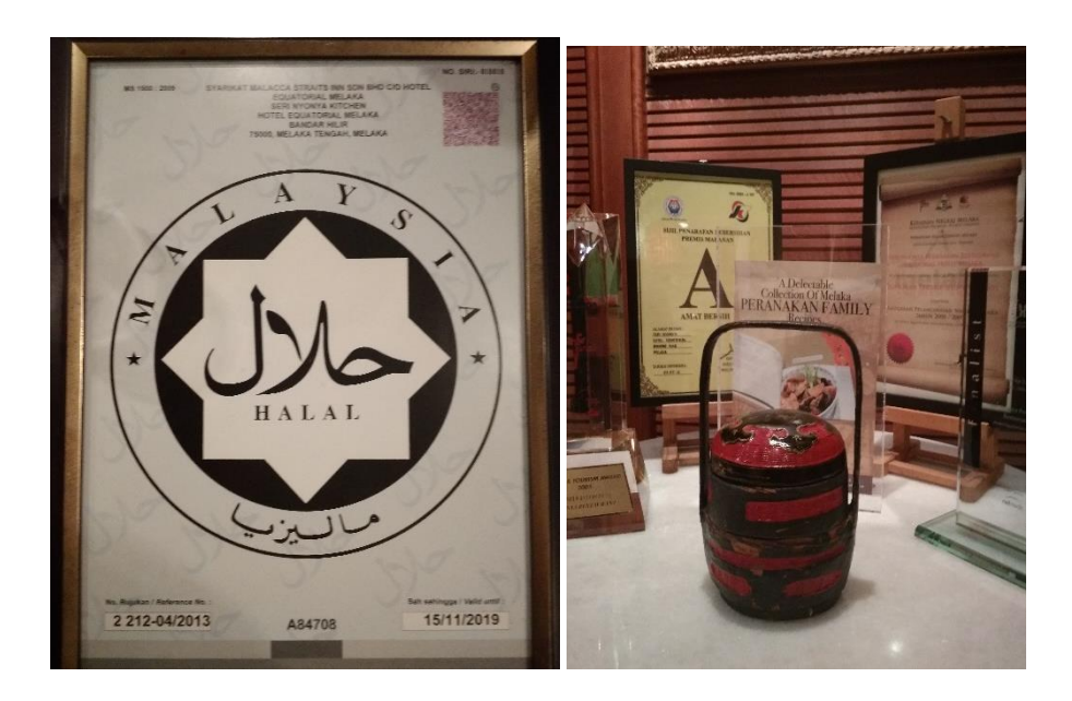
Picture 3 and 4. Certificates owned by Seri Nyonya Peranakan Restaurant displayed in the kitchen and on the table in front of the restaurant

The halal-hygiene team works also to produce standardized recipes (Standard Operating Procedures for recipe) for Baba-Nyonya foods. They should mention in the recipes the ingredients, cooking steps, and other instruction includes the brands of some ingredients and spices. With this standard, anyone (the chef in this context) should obey the 'rule' written in the recipe. The strategy is applicable for Baba-Nyonya Restaurant with frequent cook changes. Having the team and its strategy could help to maintain the quality and halal standards. Although it seems to still be complicated to apply halal certificate to JAKIM among non-Muslim owners, such halal and hygiene team is affordable to improve Muslim customer's confidence in consuming Baba-Nyonya delights.